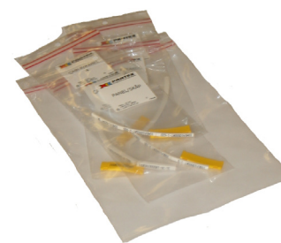
Double-sorted by cable and cabinet