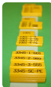
Sorted on a sheet.

A loop of semi cut sleeves, packed in plastic bags or cartons.