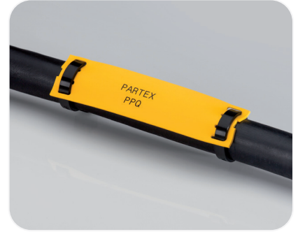
Easy installation with cable tie around the cable.