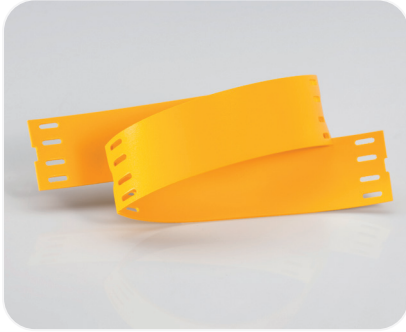
PPQ profile for printing in MK10 and EOS printer.